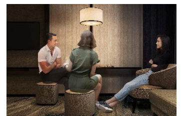
The image for 3 guests use

In this renovation, sofa beds will be set in the 40 m 2 and 80 m 2 rooms and the number of rooms that can accommodate three people will be increased, and it increase the hotel's overall capacity by approximately 130 people, making it even more likely to accommodate large events such as MICE and inbound groups.