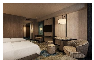
The image of 40 m 2 twin bed room

Whereas previously the number of one-bed rooms was limited, we will set the beds in a Hollywood twin style (two semi-double beds lined up side by side) in 30 m 2 and 40 m 2 rooms. By increasing the number of rooms available in the one-bed style as needed, we will be able to meet the needs of overseas guests who prefer larger beds, and families with small children, depending on the situation.