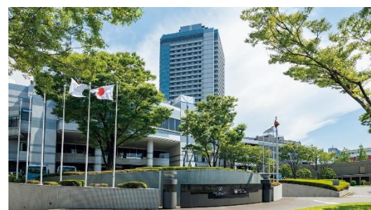
Exterior of Grand Prince Hotel Osaka Bay

Information regarding renovation, and stay package https://www.princehotels.co.jp/osakabay/plan/renovation/