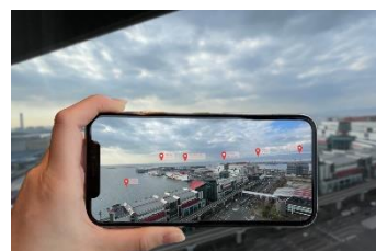
The image of AR system service

The function uses AR to display landmarks, allowing you to enjoy the view from your room like an observation deck or find places you want to go by displaying landmarks on AR system that contribute comfortable trip.