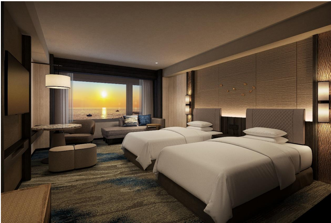
The image of guest room after renovation