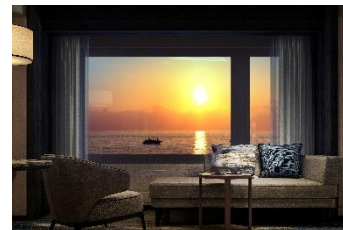
The image of view from sofa and guest room

Although located in Osaka city, our hotel faces Osaka Bay and offers a beautiful ocean view. By placing the sofa beds of the 40m 2 and 80m 2 rooms and the sofas in the bedrooms of the suite rooms by the window, you can enjoy the spectacular view, and the scenery that changes with the time will create a relaxing atmosphere in the rooms.