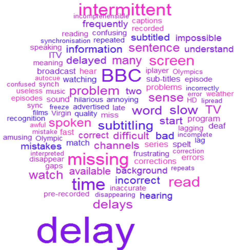
Figure 1: word cloud based on responses to AHL’s survey