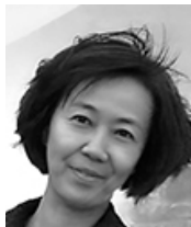
Yan Yan China