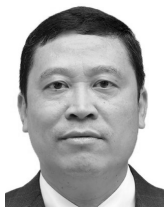
Than Duc Vietnam