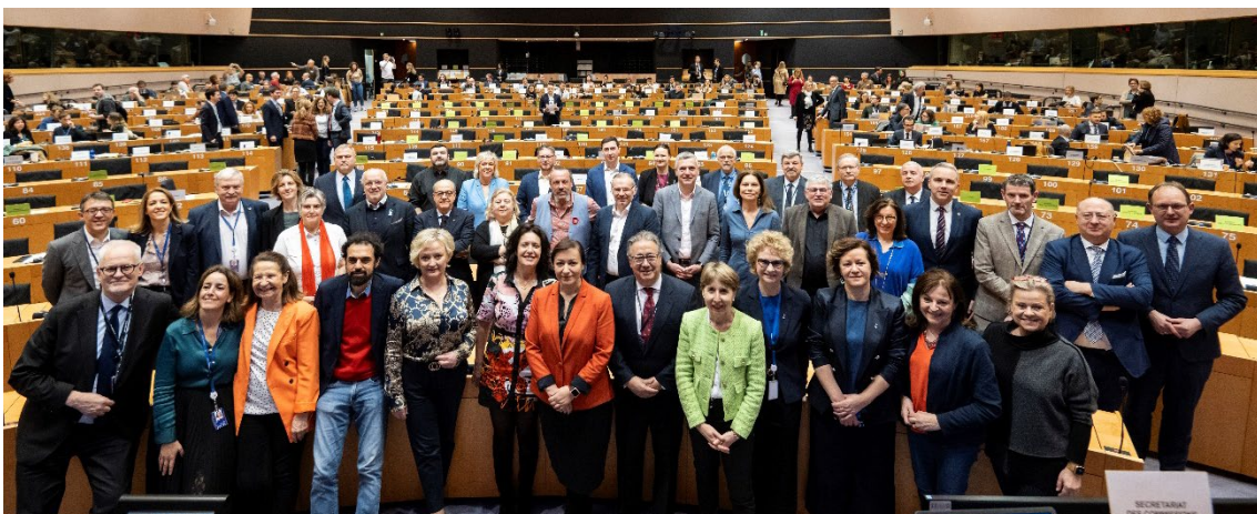
AGRI Committee meeting on 19 March 2024