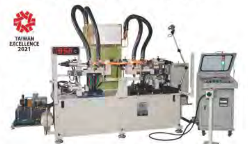
New Generation High-efficient Power-saving Inverter Heating Machine for Equalizing Bar of Automobiles.

A technology-driven manufacturer, Da Jie makes good use of advanced technologies to effectively integrate various systems and robots from different brands, and carry out smart manufacturing. Furthermore, it also designs high-efficient production processes, and employs an automated production line in its factory. By doing so, the firm aims to streamline production processes and optimize mold sharing, which is expected to boost its production efficiency by 60%.