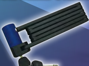
UB2240 / FOLDING LOCK • Steel W/ Hardened and Black Finish • Cylinder Dia: 30 mm • Color: Red / Yellow / Blue • Weight: 1.48 kgs

ANTI-DRILLED CYLINDER & 2 LEVEL KEYS HIGH SECURITY & TOP BEST QUALITY