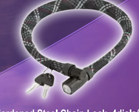
• Hardened Steel Chain Lock, 4dials/Key • With Plated / PP / PET Sleeve • Size: 4mm x 4mm x 24" (600mm)