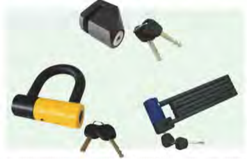
High security and quality U Bolt, Cable, Disc lock, and Anti-drilled cylinder with two keys for motorcycle and bike.

above. Made of high-quality materials and created under rigorous quality control, its products are trusted by business partners and buyers from Europe, North America, Asia, Oceania, and Africa. Please visit www.steelmark.com.tw for more information.