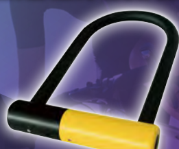
UB2200 / DOUBLE LOCKING • Steel Shackle & Body W/ PVC Coated • 110 mm W x 185 mm H x 14 mm • Color: Red / Yellow / Blue / Black