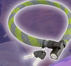
CL-879 (Key Lock) CL-881 (Combination Lock)