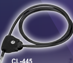
CL-445 • Adjustable Cable Lock • Soft Rubber Cover • Dia: 10mm; • Length: 120/150/180/210cm • Color: Black / White / Orange