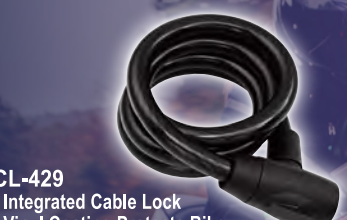
CL-429 • Integrated Cable Lock • Vinyl Coating Protects Bike • Size: 15mm x 60/90/120mm