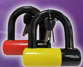
UB2230 / Double Locking • Steel Shackle with PVC Coated Body • Size: W 55mm x H 52mm x 14mm