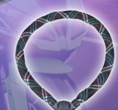
CL-419 • Nylon Cover Won't Chip Your Paint. • V-Shaped Lock Head