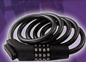
CL-8612 • Integrated Combination Lock • Resettable Code • Tough Vinyl Cable Cover