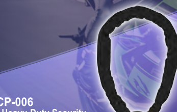
CP-006 • Heavy-Duty Security. • Ideal for Securing Bicycles and Motorcycles.