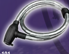
AC-101 • Steel Sleeve Resists Cutting and Sawing • Vinyl Coating Prevents Scratches • Sliding Dust Cover Protects Keyway • Size: 18mm x 60/90/120mm