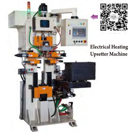
Electrical Heating Upsetter Machine