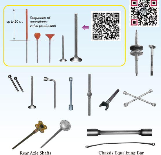
Rear Axle Shafts