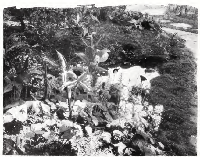
Maple Brook. The large plant in the middle is Veratrum viride ; Cypripediums beyond the pool and Primula japonica in the distance