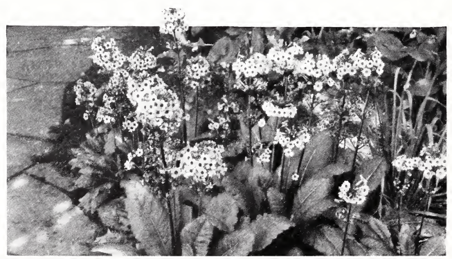
Primula japonica flourishing in the mud

Bloodroots have found a congenial home high up in this section, and Clintonia borealis seems well established close to a rather interesting plant of Daphne mezereum . A Forget-me-not, which had been growing in the neighborhood long before this moist spot was created, traveled into it with great speed, soon taking possession to the exclusion of almost all else. This we could not tolerate, so the Myosotis was removed to another swamp later prepared for it.