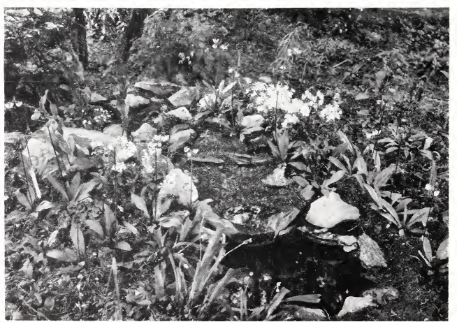
Phlox divaricata, Cypripediums, and Dodecatheons along the rill. Stellaria pubera above the stone at upper left

here and there, and covered with leaf-mold so that no cement could be seen. Where the water overflowed from the stone into the trough below, a bowl-like arrangement of rough stones was built to form a pool some two feet in diameter. The trough to the left of this was filled with rocks of varying sizes and ordinary garden soil; to the right it was filled with stones, peat, sphagnum moss, and leaf-mold; thus making two tanks of mud, one sweet, one sour. This work was done in the late summer of 1927, and that autumn a large collection of native plants was installed. A tiny Hemlock was set to hang over the outlet from the water-pipe, thus disguising the source of the water-supply. A mat of Wintergreen was laid beneath the Hemlock against the wall. Bulbs of Lilium superbum were tucked in below that, and on the sloping bank above the tank quantities of Cypripedium pubescens and Cypripedium parviflorum, Dodecatheon meadia, Viola pedata, Dicentra cucullaria, Phlox divaricata, and Trillium undulatum were hopefully planted for spring bloom.