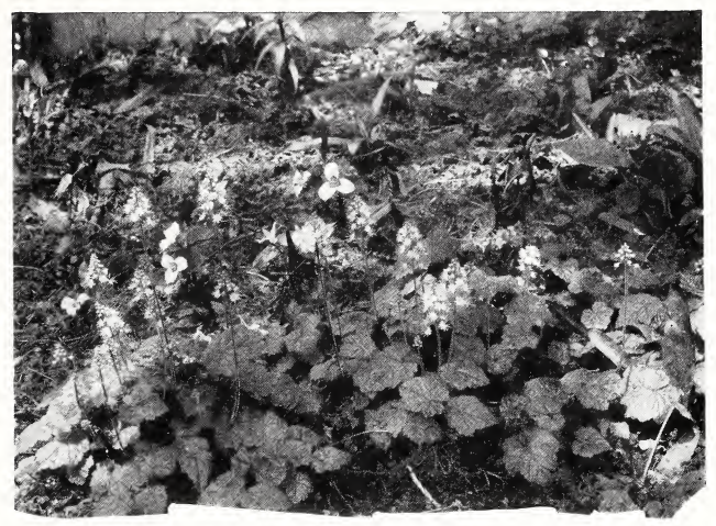
Trillium undulatum and Tiarella cordifolia in Maple Brook

average nursery catalogue or the average home-planting would be something to weep over.