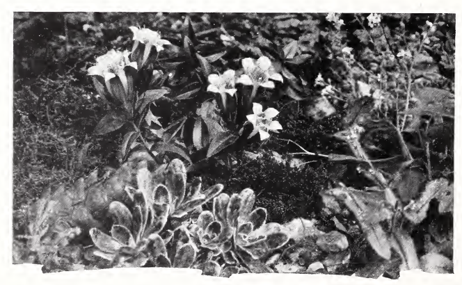
Gentiana septemfida and an encrusted Saxifraga

(Accounts of the other Rock-Garden Adventures will) appear in subsequent issues of Breeze Hill News