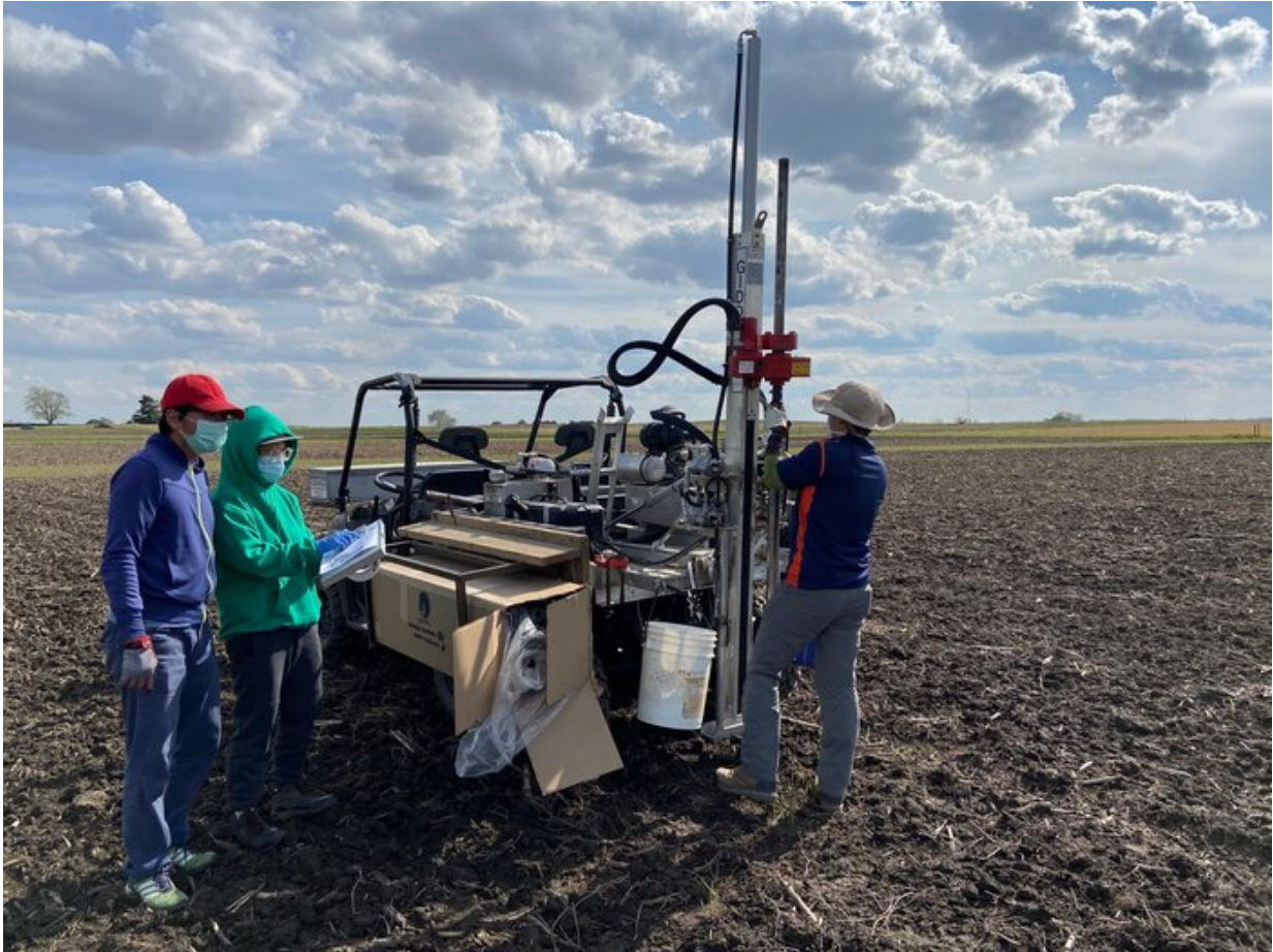
SMARTFARM team members collecting soil samples.