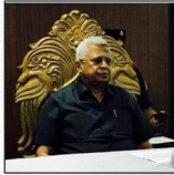
Mr. Tathagata Roy, The Governor of Tripura

His Excellency Mr. Tathagata Roy was the keynote speaker in the Techno-Management Fest in IEM. INNOVACION dealt with and promoted the need for innovation. He stressed on the fact why India, in spite