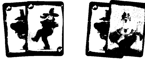
Player #1's dancing pairs