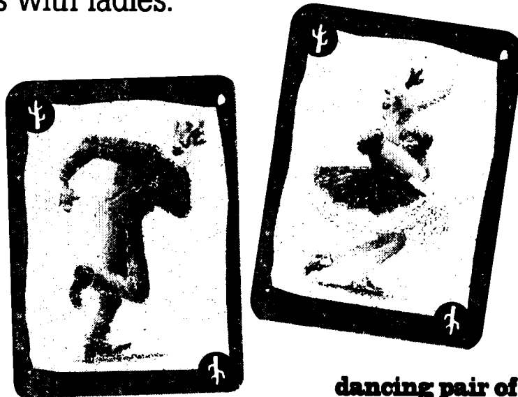
dancing pair of the cactus suit

Match a dancer card from your hand with a dancer card of the same suit from the center dance hall. You may pair ladies with gents, gents with gents, or ladies with ladies.