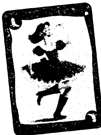
dancing pair of the boot suit

That card must be a dancer (either a lady or a gent). If the top card is a cow, bull, or Madame Fifi, return it to the middle of the deck and draw again.