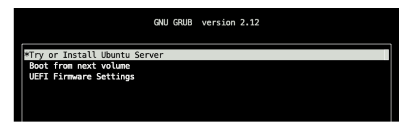
Figure 5. Selecting an Installation Option