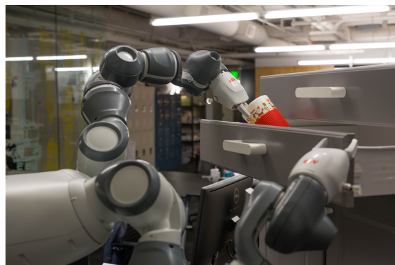
Fig. 1. A motivating application for this work is operating collaboratively in human environments, which are unstructured and highly dynamic. Here a two-armed ABB YuMi robot opens a drawer and inserts a cup, while avoiding unintended collisions. To solve such problems, fast reactive local control is critical. In this work, we present a framework for incorporating agile, reactive, highly adaptive behaviors in a modular way. The resulting motion generation system aggregates hundreds of controllers, is straightforward to implement, and performs well in practice.

In this work, we show that many seemingly complex motion generation problems, ones that seem easy and commonplace for humans but which are highly constrained and therefore difficult for modern planners and optimizers, are actually