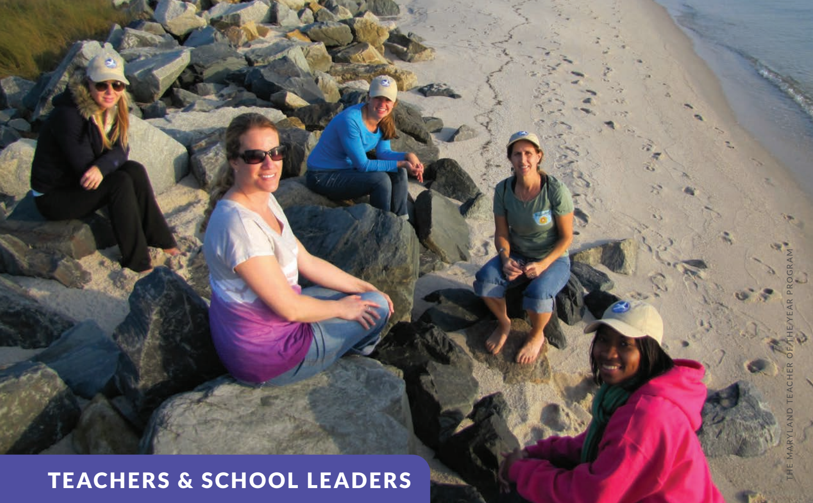
THE MARYLAND TEACHER OF THE YEAR PROGRAM