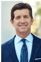
Alex Gorsky Chairman and CEO Johnson & Johnson