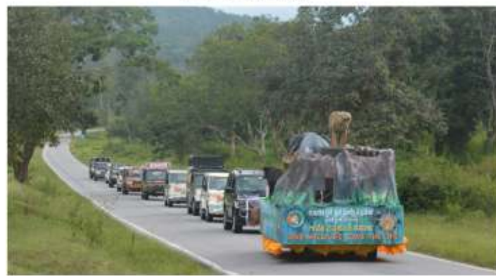
'India for Tigers - A Rally on Wheels' at Bandipur Tiger Reserve, Karnataka