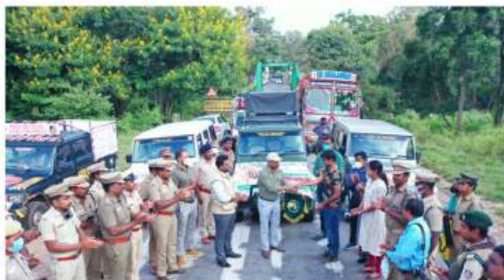
Handing over NTCA flag to Bandipur Tiger Reserve Field Director