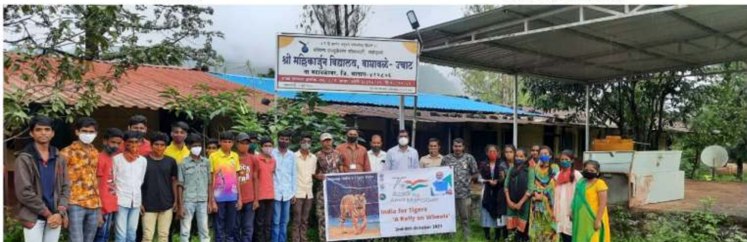
Local communities participating 'India for Tigers-A Rally on Wheels' at Sahyadri Tiger Reserve, Maharashtra