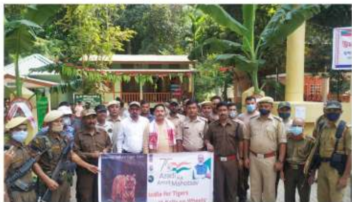
Forest officials and dignitaries at Orang Tiger Reserve, Assam