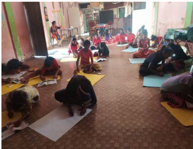
School students participating in drawing competition held by Indravati Tiger Reserve