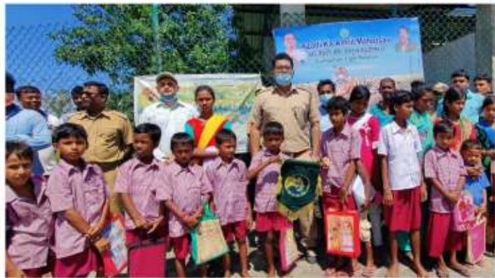
Sundarban Tiger Reserve - School kids participating in 'India for Tigers A Rally on Wheels'