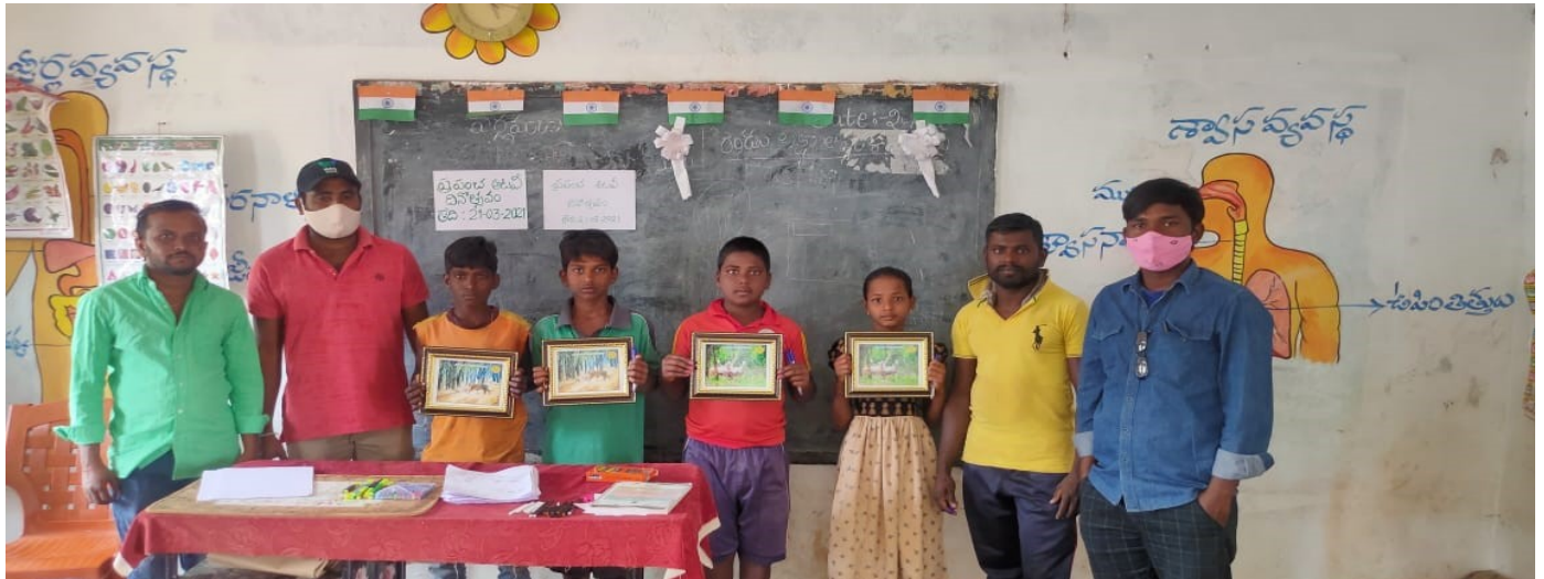
School students during an art competition organized by Amrabad Tiger Reserve, Telangana