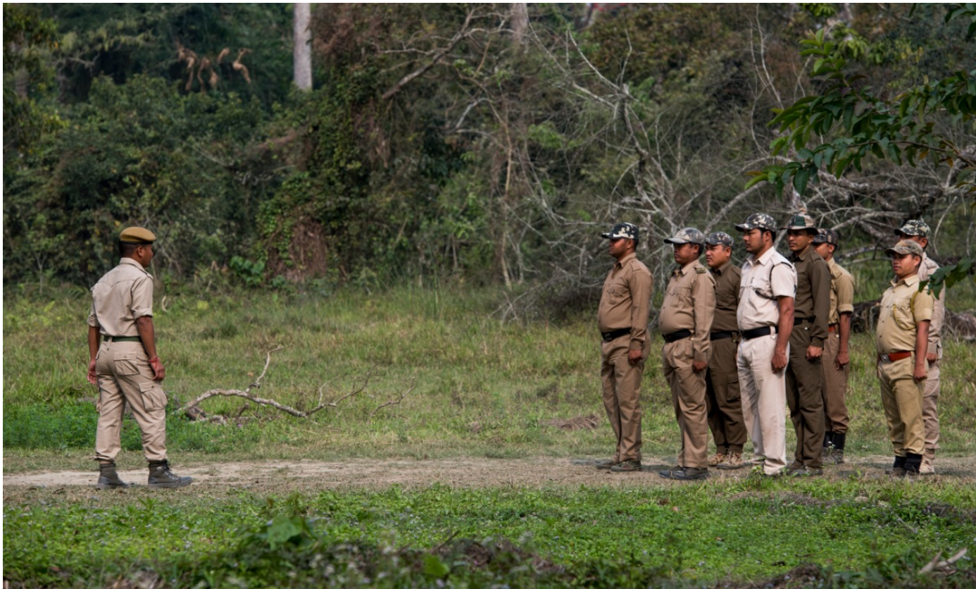
Forest officials getting ready for patrolling in Kaziranga Tiger Reserve, Assam

Foot patrols by frontline forest staff are carried out to actively monitor the protected areas and to strengthen the protection regimes and detect emergencies. Active monitoring is the strongest deterrent to illegal hunting and poaching inside protected areas. Foot patrols also serve several purposes and can collect a diversity of data.