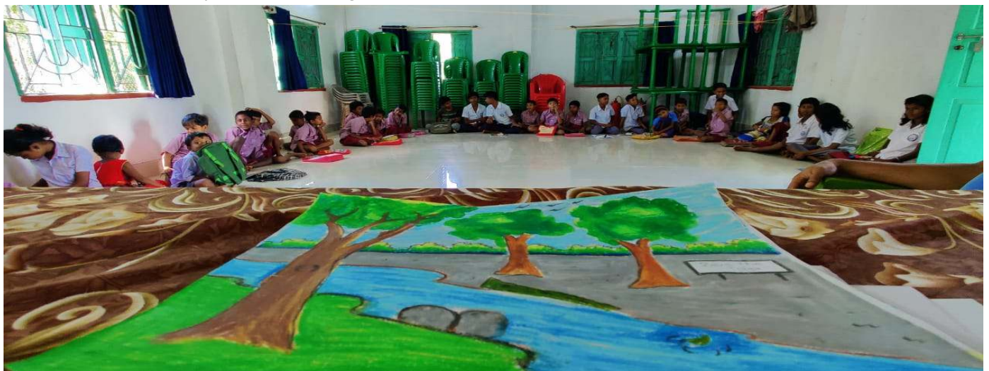
Pench Tiger Reserve - School students participating in outreach activities