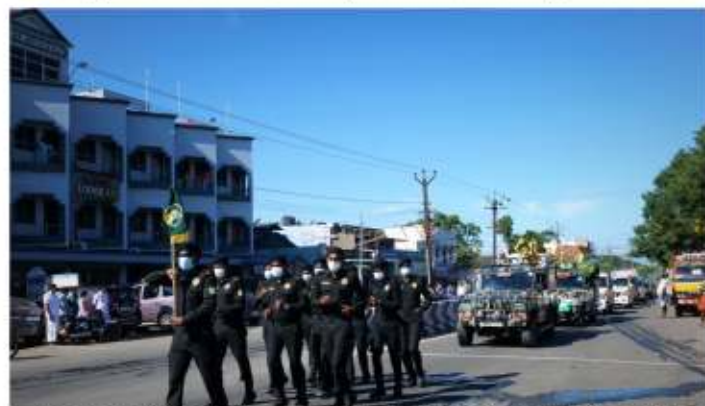
Anamalai Tiger Reserve forest officials marching with the NTCA flag