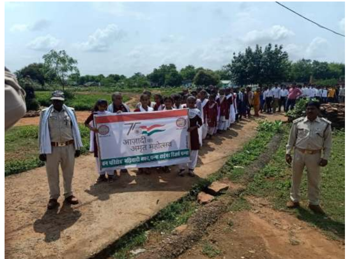
Panna Tiger Reserve's awareness rally attended by school students