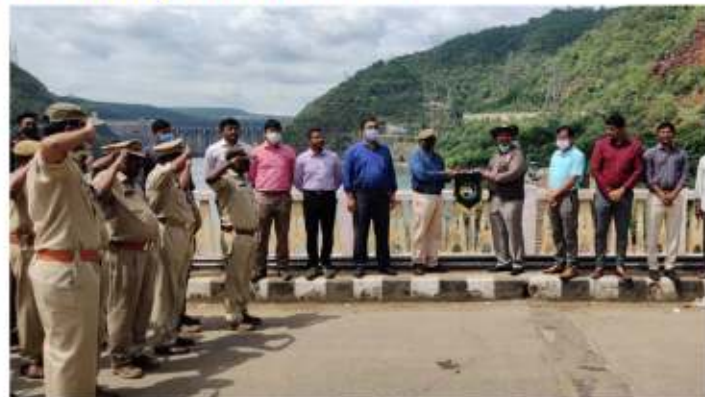
Nagarjunsagar-Srisaillam Tiger Reserve Field Director handing over the NTCA flag to Amrabad Tiger Reserve