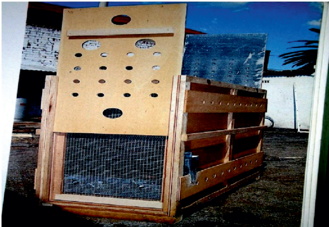
A Cage on the Said Scheme