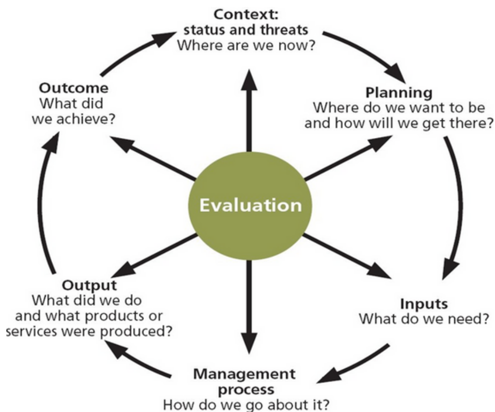
Figure 1: The WCPA Framework for assessing Management Effectiveness

Of these elements, the outcomes most clearly indicate whether the site is maintaining its core values, but outcomes can also be the most difficult element to measure accurately. However, the other elements of the framework are all also important for helping to identify particular areas where management might need to be adapted or improved.