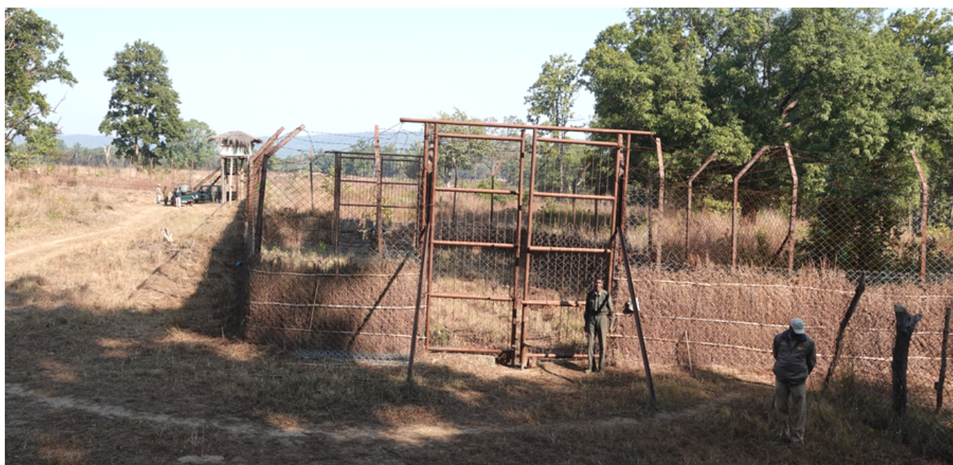
Tiger Enclosure- Kanha Tiger Reserve, Madhya Pradesh

*Score: Poor: 2.5; Fair: 5; Good: 7.5; Very Good: 10