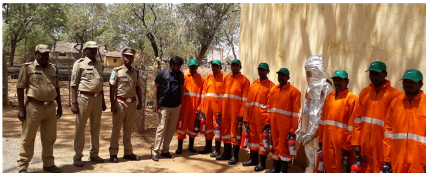
Fire Fighting squad in Tiger Reserve

*Score: Poor: 2.5; Fair: 5; Good: 7.5; Very Good: 10