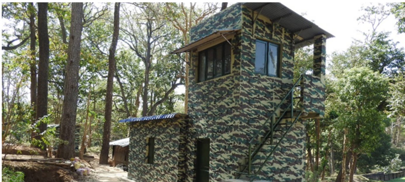
Anti-poaching camp-Mudumalai Tiger Reserve, Tamil Nadu

*Score: Poor: 2.5; Fair: 5; Good: 7.5; Very Good: 10