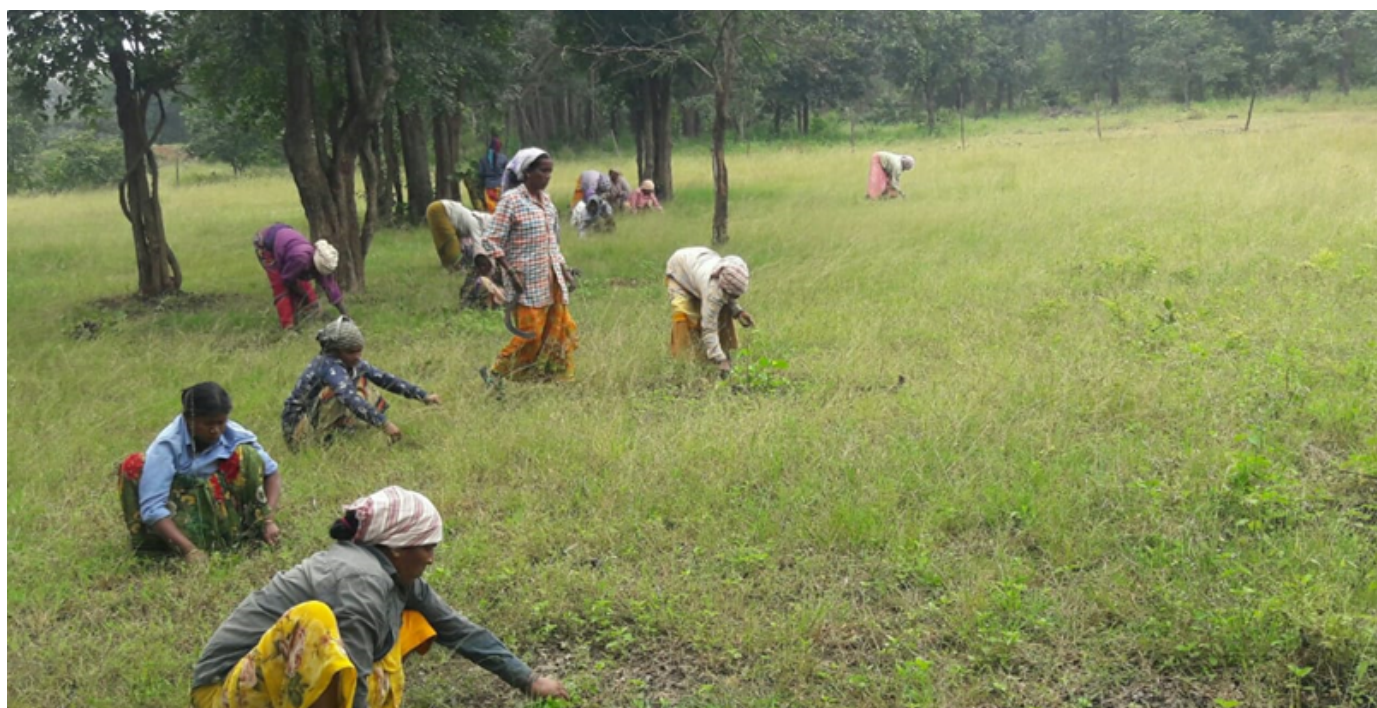
Habitat Management by local communities

*Score: Poor: 2.5; Fair: 5; Good: 7.5; Very Good: 10