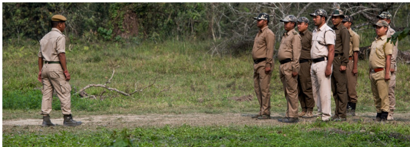
Forest Frontline Force in Kaziranga Tiger Reserve, Assam

*Score: Poor: 2.5; Fair: 5; Good: 7.5; Very Good: 10