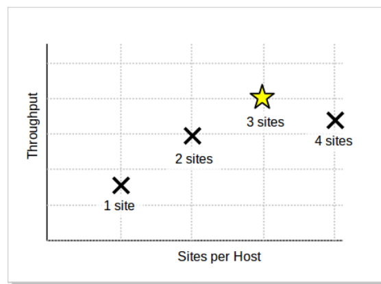
Figure 5.2. Determining Optimal Sites Per Host

By graphing the relationship between throughput and partitions using a benchmark application, it is possible to maximize database performance for the specific hardware configuration you will be using.