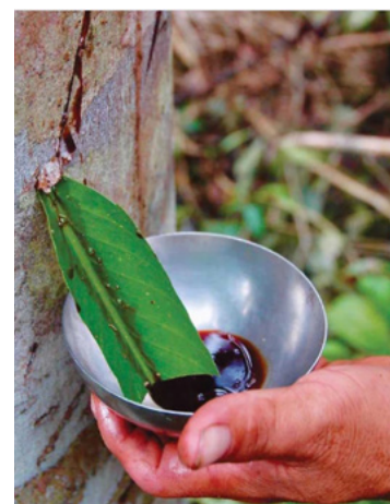
Extracting sap from a Croton lechleri tree in the Northwestern Amazon

Crofelemer is a natural product sustainably derived from the sap, or latex, of the Amazonian tree species Croton lechleri , which has a rich history of medicinal use by Indigenous peoples in the Western Amazon rainforests of South America. To learn more about the history of crofelemer, see The Ethnobotanical Origins of Canalevia-CA1 section of this guide.